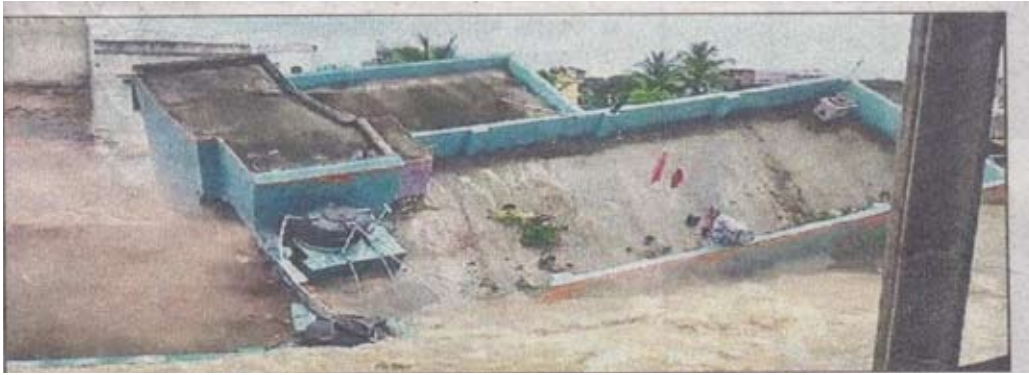
Fig. 4 : A two-storied house was washed away due to floods following heavy rainfall in Junbadia village in Bankura district of West Bengal, India as observed on 6.8.2018. (Source : Anandabazar Patrika dated 7.8.2018 published from Kolkata, West Bengal, India.)