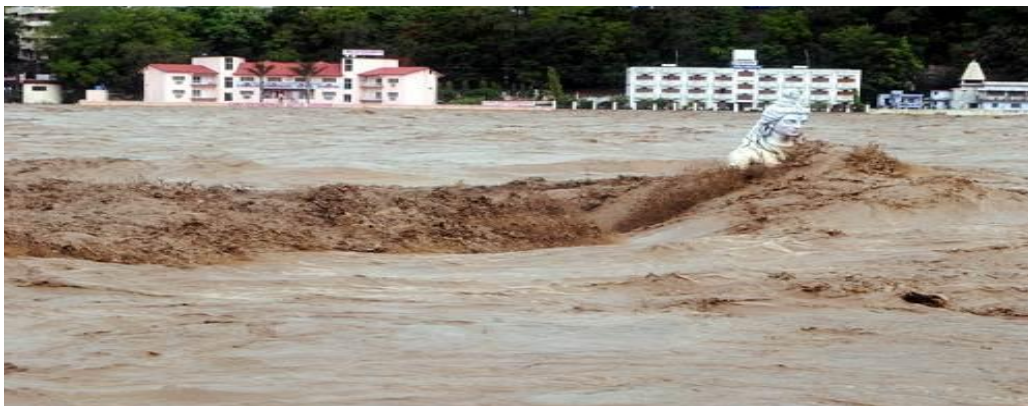
Fig. 3 : Flood in Rishikesh in Uttarakhand as observed on 24 June 2013.