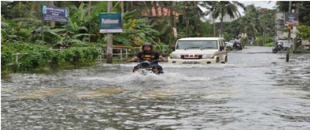
Fig. 5 : Commuters wade through flooded streets in Kozhikode district, about 385 km north of Trivandrum, in the south Indian state of Kerala, on August 17, 2018