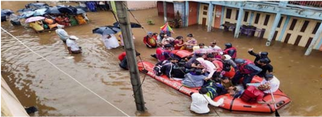
Fig. 6 : National Disaster Response Force conducts a rescue operation at a flooded area of Tambve village in Karad in Satara district in Maharashtra in India on 2.10.2019.