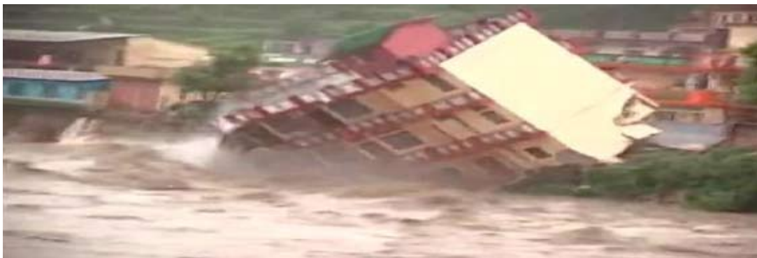
Fig. 2 : A large number of structures including hotels, commercial and residential buildings close to river Alaknanda caved in like a pack of cards in Rudraprayag district in Uttarakhand as observed on 17 June 2013.

Flood defense education of the people from school level may reduce the flood damages considerably. It has been observed that there starts hue and cry, panic and confusion on the occurrence of floods due to lack of flood defense education. The people do not know how to respond to this natural event. Flood defense strategies, which the people may use in flood crisis, should be the part of education curriculum as a compulsory subject taught particularly to the people living in more potentially flood prone areas. If the people are such trained they can seek appropriate solution to the flood problem themselves and thus major flood damage can be minimized, if not prevented, resulting in saving of country's exchequer which otherwise might be expended on flood relief and rehabilitation measures. Flood proofing measures consisted of raising a few villages in the flood prone areas above pre-determined flood levels and connecting them to nearby roads or high lands. Building houses on high and raised grounds was an age-old system in rural India. Other method of flood proofing like use of aluminum / steel bulkhead in doors and closure of low-level windows and other opening, etc are commonly used.