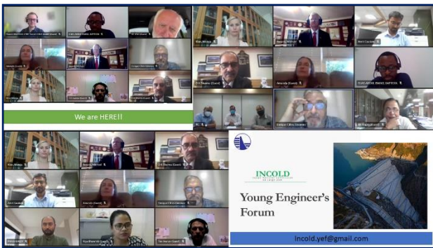
Official Launch dated 02.07.2021

INCOLD YEF Was officially launched on 2 nd July 2021 with vision of Bringing together young engineers and students from pan India on a common platform to promote understanding and awareness of roles of Dams in beneficial and sustainable development. To Promote long-term direction for knowledge, career building and exploring of ideas by communicating internally and externally.