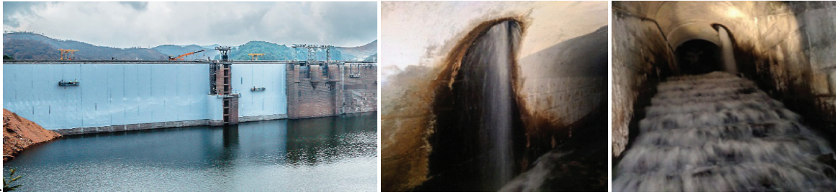
Figure 9 : Leakage in vertical shaft of drainage gallery at left. At right, geomembrane lined on the upstream face of the dam as of June 2019.

challenges of extreme cold weather and location of the dam in a deep reserved forest, the balance work has been planned to get completed in second phase between Jan and June 2020. The water from the Upper Bhavani dam acts as the main source for a series of cascaded power houses with a total power generation capacity of > 600 MW. Thus, saving water is of utmost importance for the client TANGEDCO