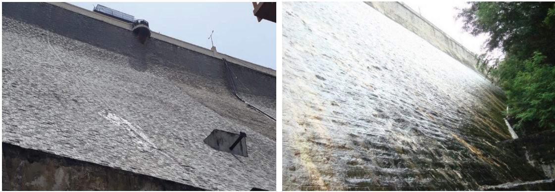
Figure 6 : Downstream side before and after geomembrane installation.