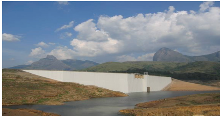
Figure 4 : Kadamparai dam after installation of the geomembrane system