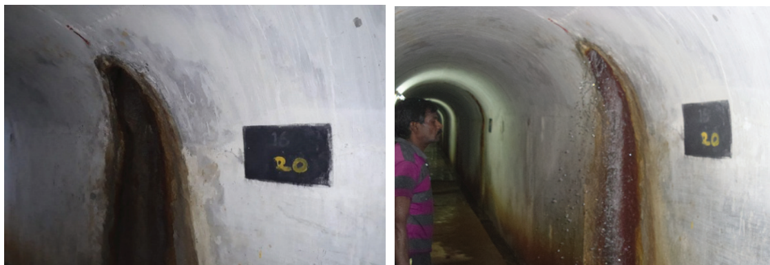
Figure 7 : Vertical shaft leakage before and after geomembrane installation.

The results achieved is yet another proof of effective and professional design of geomembrane waterproofing system on large dams. A dam which was leaking at a rate of > 6,000 litres/minute is now reduced to just < 2 litres/minute on the left and spillway section.