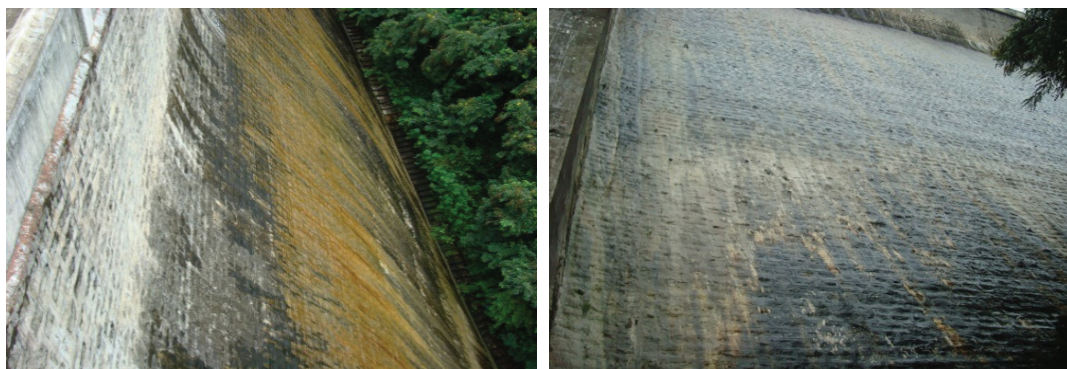
Figure 5 : Heavy seepage on left flank.

Earlier attempts by the maintenance wing of TANGEDCO (Generation Team) consisted of racking/packing with cement mortar, racking/packing with chemical epoxy/mortar, grouting and joint chemical treatment. The attempts to control the seepage did not give a permanent solution and instead the leakage continued to rise every year. With the available data and observation, the water oozing out from the downstream side should be more than 5,000 l/minute (approximately) from the left and spillway blocks.