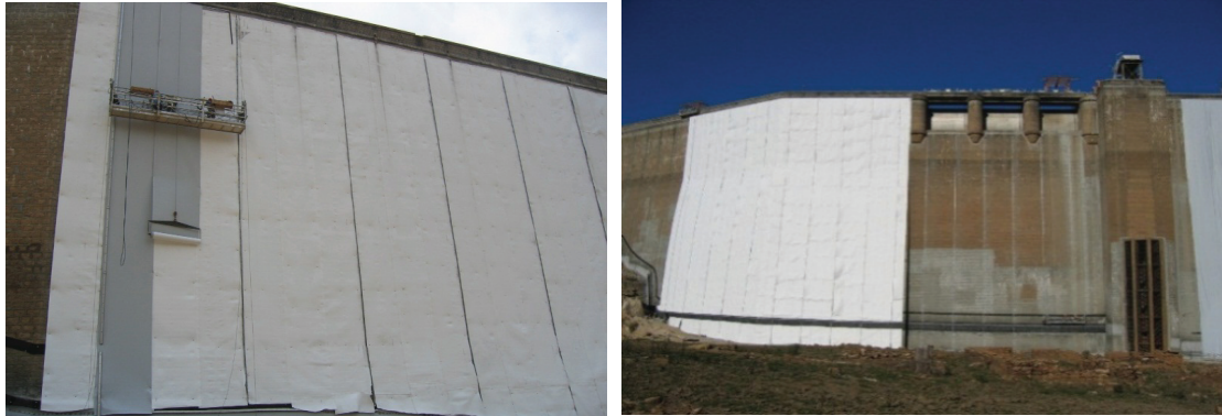
Figure 1 : Installation of anti-puncture geotextile and of waterproofing geocomposite.

The major elements included the anti-puncture geotextile layer of 2000 g/m 2 , installed on the entire upstream face of the dam to reduce risk of puncture by the very aggressive surface of the stone masonry blocks. The nonwoven needle-punched geotextile made of pure polyester fibre was anchored to the face (Figure 1 at left).