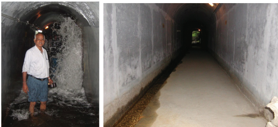
Figure 3 : Drainage gallery before and after geomembrane installation.

Carpi was awarded the India Power Award for the year 2008 for this project in recognition for “Excellence in Water & Energy Management”