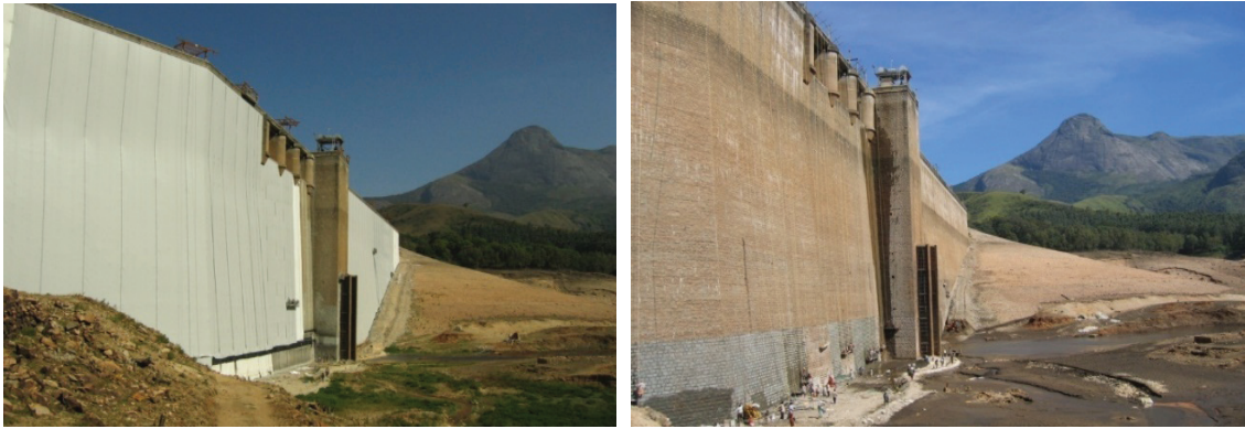
Figure 2 : Upstream face of the dam before and after geomembrane installation.

Carpi was awarded the India Power Award for the year 2008 for this project in recognition for “Excellence in Water & Energy Management”