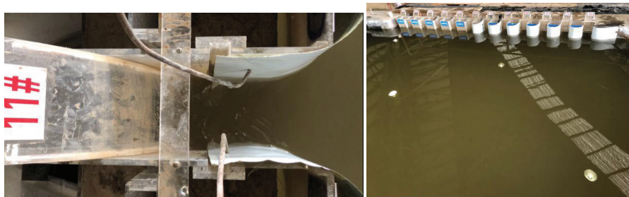
Pervious Pier Effect