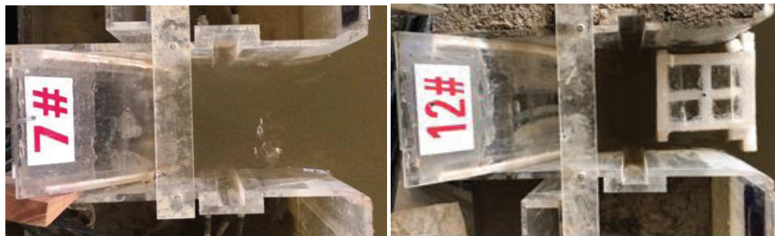
1# Floating Drainage Device Effect

In the model test, the vortex elimination measures such as floating drainage device and pervious pier are explored. When the opening height of gates in surface orifice is lower than 6m, the vortex elimination effect is good; the depth of floating drainage device below water is about 1.0m. As for pervious pier, the head is elliptical, the long half axis is 10m, the short half axis is 3.6m and the underground water depth is 6m. The pervious pier has permeable structure with equal pressure inside and outside the pier so as to ensure the safety of structure and provide the convenient conditions for reconstruction of existing projects.