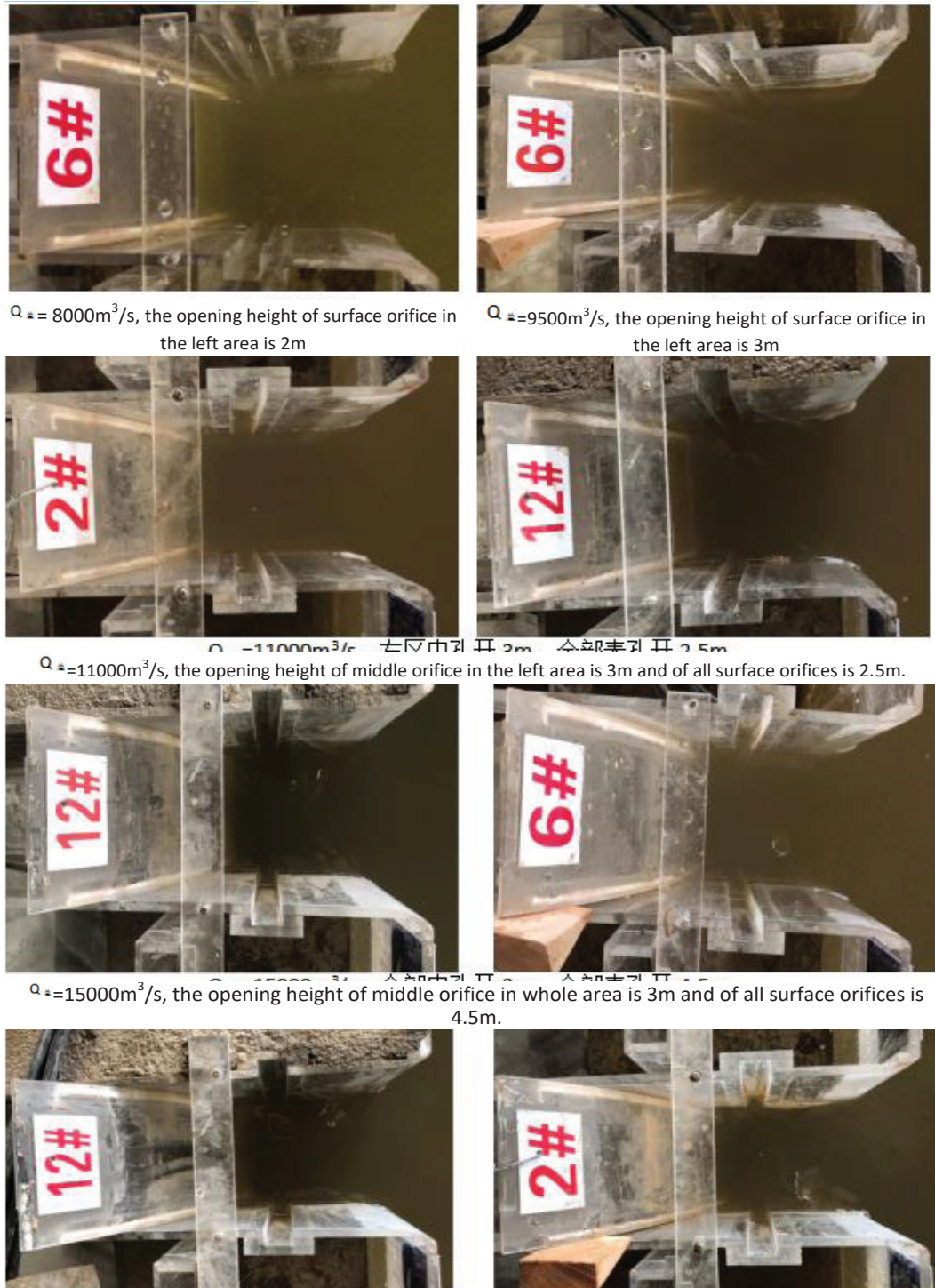
Figure 4 : Reappearance of characteristics of vortex at the gate head with large scale physical model.

Impact of operation modes of left and right power plants on vortex characteristics: If the right power plant is in operation while the left power plant is not in operation, the vortex intensity in intake of the surface orifices will increase; if the left power plant is in operation and the right power plant is not in operation, the vortex intensity in the intake of surface orifices will not change much.