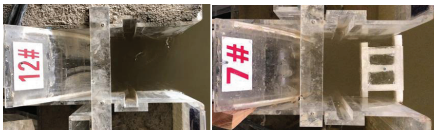
2# Floating Drainage Device Effect