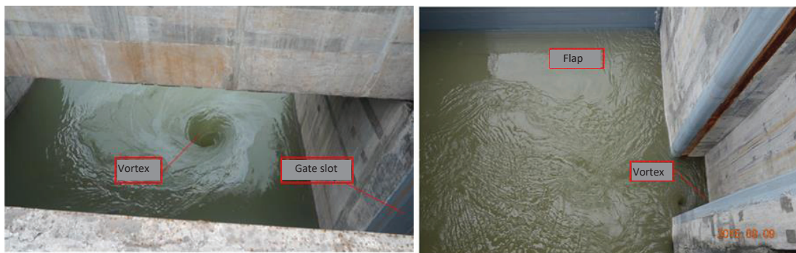
(a) Vortex flow pattern in gate chamber in surface orifice in 2017 (b) Vortex in gate slot in 2015

The safety of flood discharge facilities is related to the overall operation safety of a dam. In recent years, during operation of spillway surface orifices, the operators of power plants and observers of prototypes found that there were free vortices in gate slot and at gate head to different extents. When the vortex is large, abnormal sound and gate vibration occur. To ensure the safe operation of flood discharge facilities, it is necessary to research the adverse effect of vortex on the operation of hydraulic structures and gates, the formation mechanism of vortex and the vortex elimination measures.