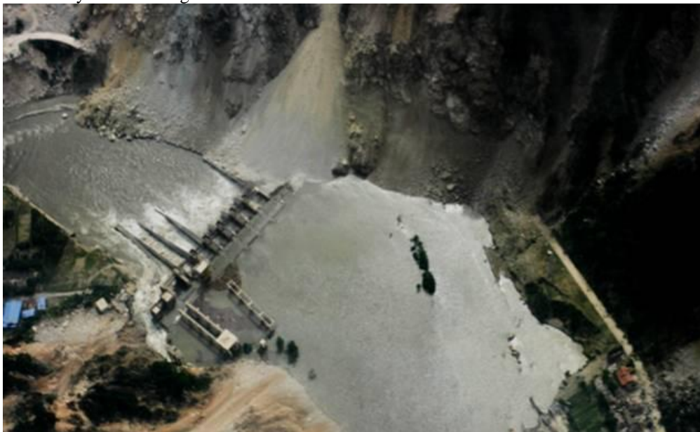
Figure 3: Overtopping of Taipingyirun-of-river power plant after the 2008 Wenchuan earthquake in China