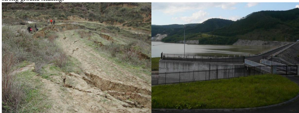
Figure 4: Failure of Sharredushkembankment dam in Albania due to a magnitude 4.1 earthquake in 2009 (left) and undamaged Aratazowarockfill dam in Japan, which was subjected to peak ground acceleration of 1.0 g during the magnitude 7.2 Iwate Miyagi Earthquake in 2008 (right)

A strong earthquake may affect all dams of a dam cascade at the same time, but the ground motion will be different in every site. The weakest dam will fail first. As shown in Fig. 4, poorly designed and constructed dams will fail under moderate earthquakes, whereas well-designed and constructed dams can withstand very strong ground shaking.